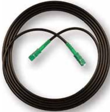
EZ-Bend 4.8 Indoor/Outdoor Cable