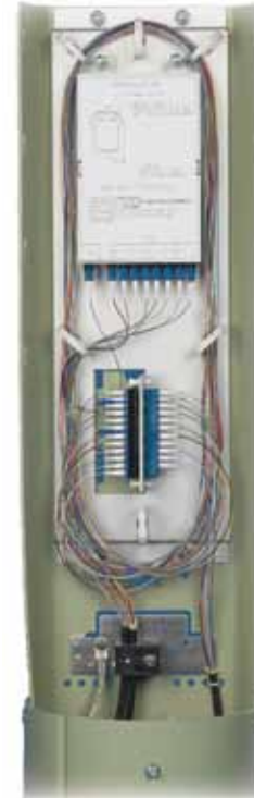
Example of OSP Module within a Pedestal