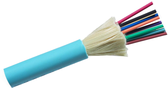
ACCUMAX LaserWave Cable