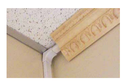
MDU and in-home solution