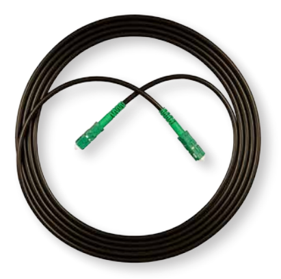
EZ-Bend 4.8 Indoor/Outdoor Ruggedized Assembly