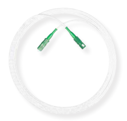
EZ-Bend 3.0 Indoor Ruggedized Assembly