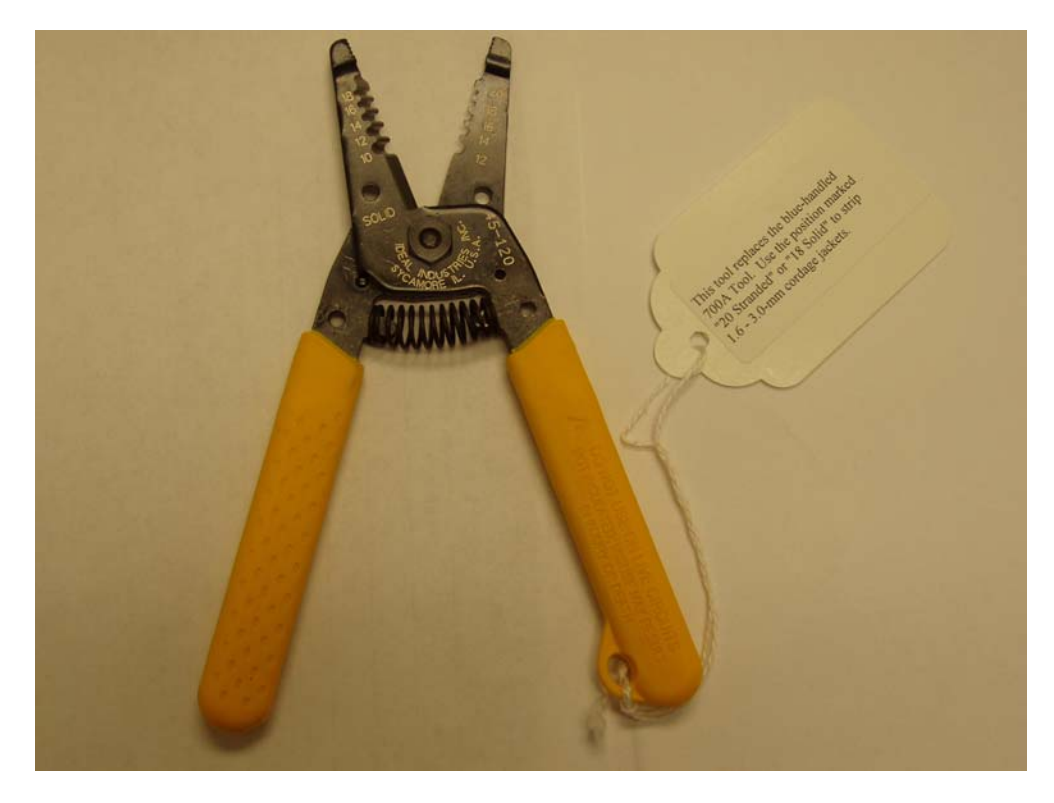
Figure 2. Ideal 45-120 Strip Tool w/ Note Card Attached