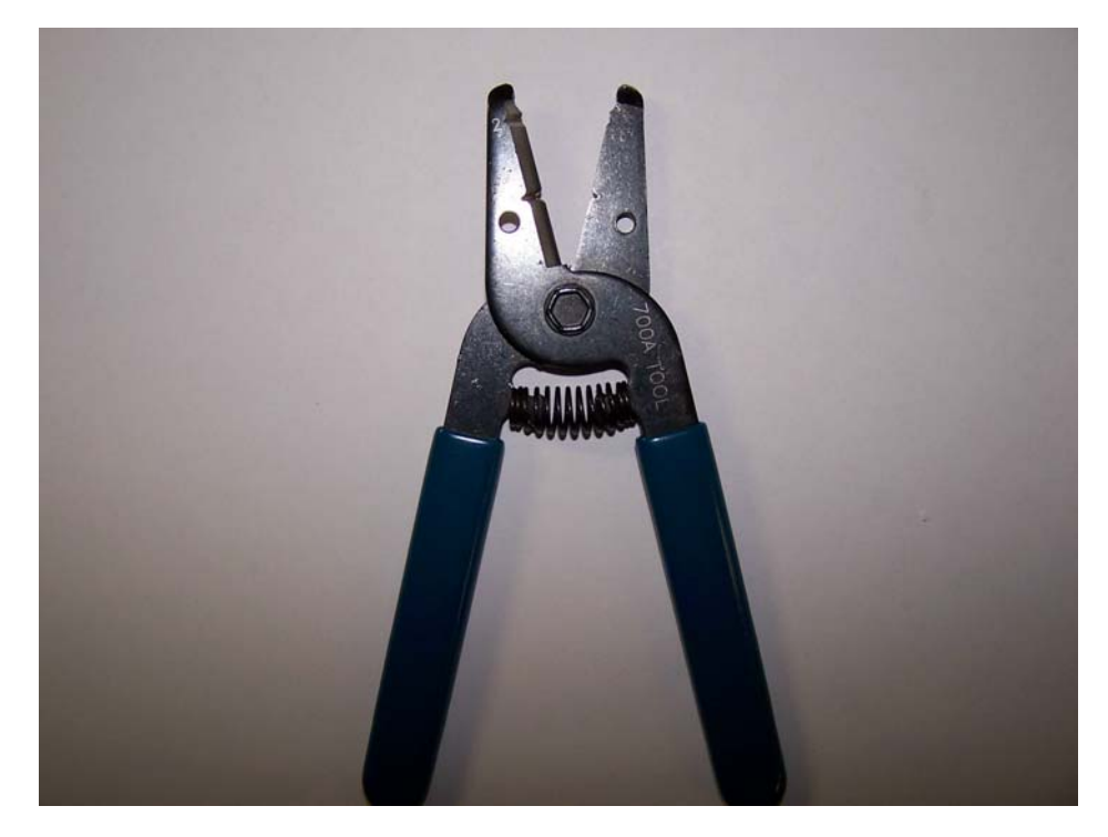
Figure 1. Blue-Handled 700A Stripping Tool