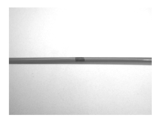
Figure 3 – Mark the section of buffer tube to be removed