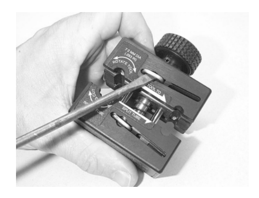
Figure 6 – Remove the locking clip.

8.3 Insert the tip of the locking clip in the elongated slot and push the cutting blade out of the tool (Figure 7).