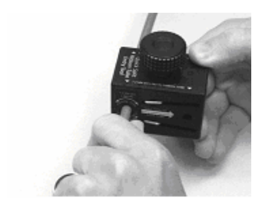
Figure 4 – Rotate the tool ½ turn to ring cut the buffer tube.

6.6 Remove the buffer tube from the end of the ribbons and clean them with lint free wipes and an approved fiber cleaning solvent. Dry the ribbons thoroughly after cleaning. See OFS Installation Practice IP-041 AccuRibbon® Cleaning Procedure for detailed ribbon cleaning instructions. The fiber ribbons are now ready for testing and/or splicing.