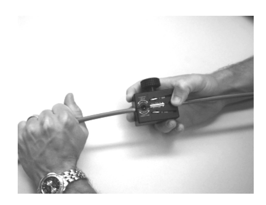
Figure 5 – Pull the Quick Split RT tool lengthwise to split the tube.