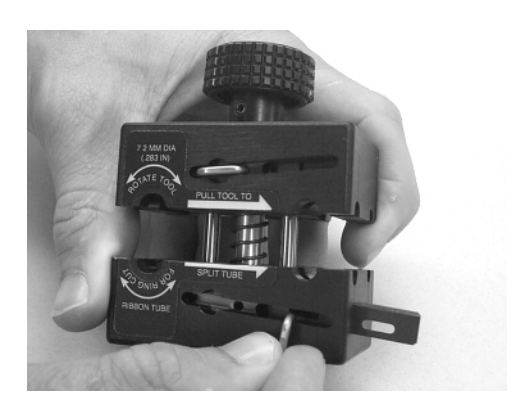
Figure 7 – Slide the cutting blade out of the tool.

8.3 Insert the tip of the locking clip in the elongated slot and push the cutting blade out of the tool (Figure 7).