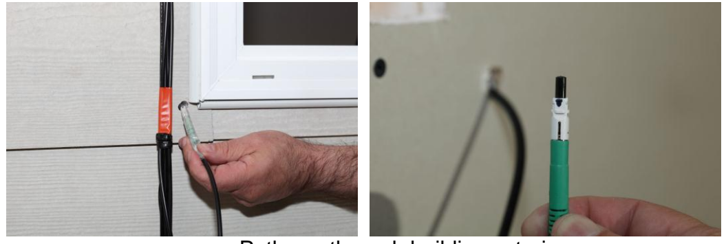
Pathway through building exterior

2. Replace the clear plastic bag over the connector and thread the connector through the drilled hole in the exterior wall.