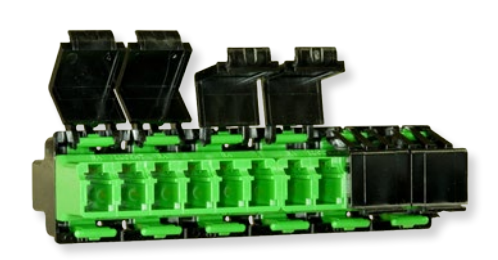
LC Ganged Adapter

Offering A High-Density Adapter Solution