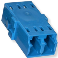
LC Low-Profile Adapter