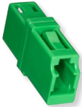
Single-Mode LC Simplex APC Adapter

Providing High Density Connection Solutions