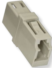
Multimode LC Simplex Adapter