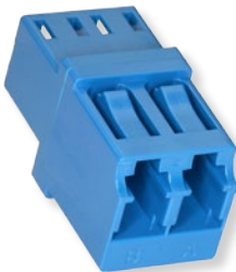
Single-Mode LC Duplex Adapter