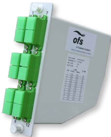
MPO Optical Fanout Module